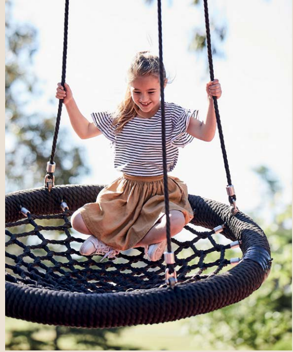
↑ Connection and creative play