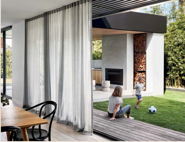
↑ More space to build your dream