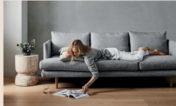
↑ Lots designed for maximum building area